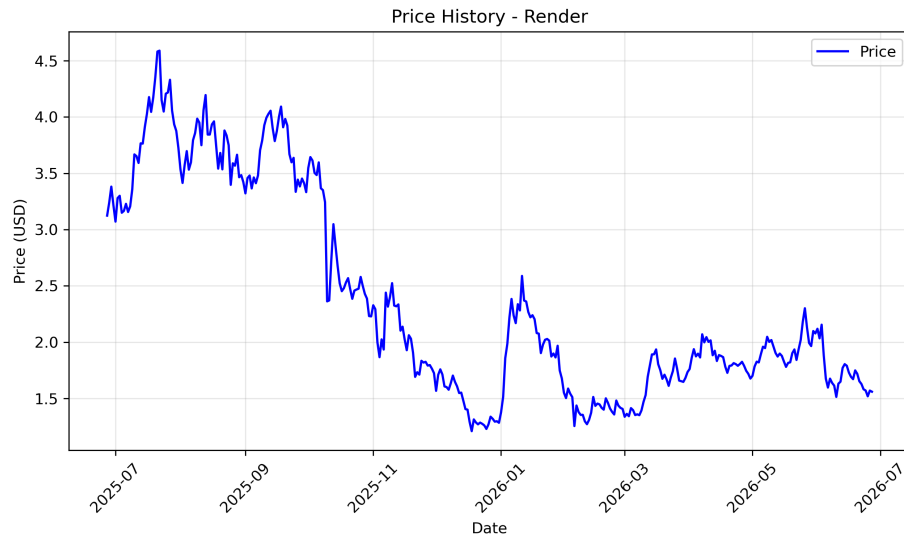
Figure 1: Price Chart