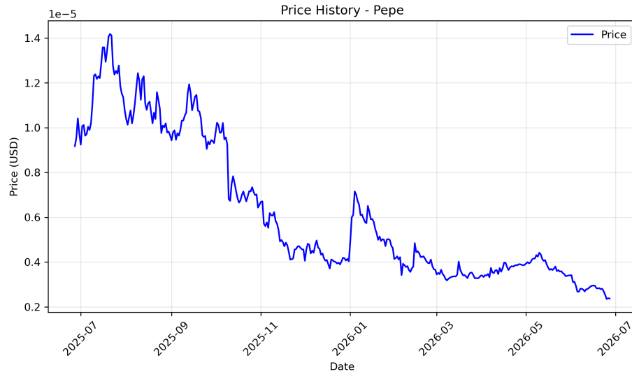
Figure 1: Price Chart