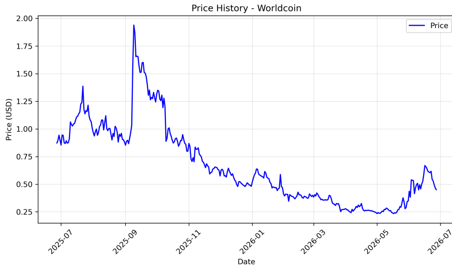
Figure 1: Price Chart