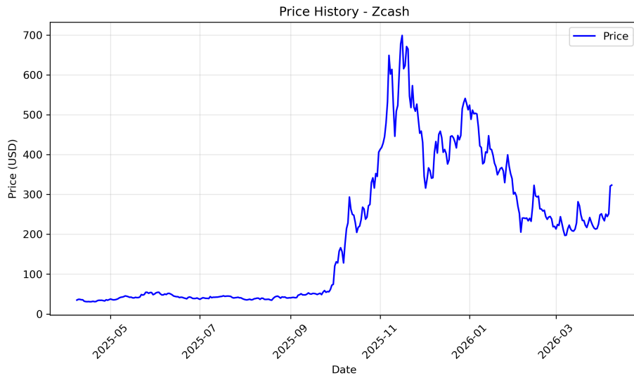
Figure 1: Price Chart