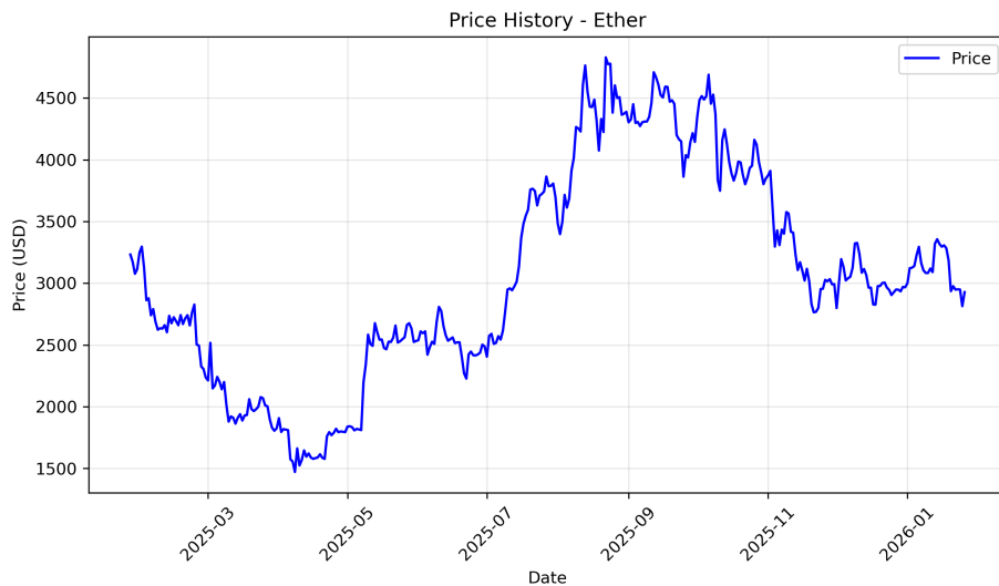
Figure 1: Price Chart