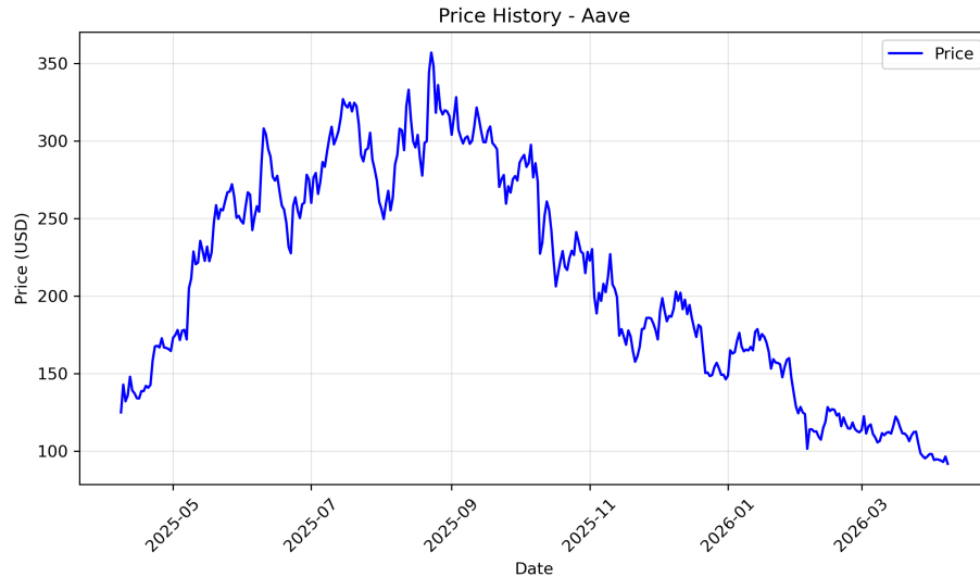
Figure 1: Price Chart